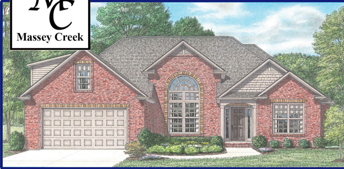
RANCH 2481 Sq. Ft. • 3 Bed/3 Bath