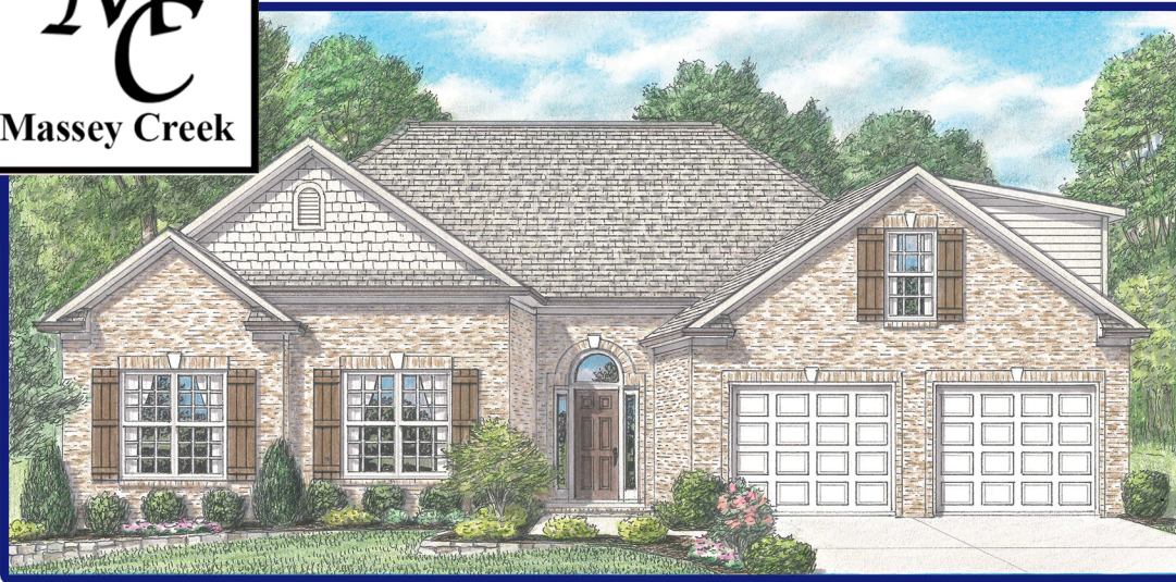
RANCH 2664 Sq. Ft. • 3 Bed/2 Bath